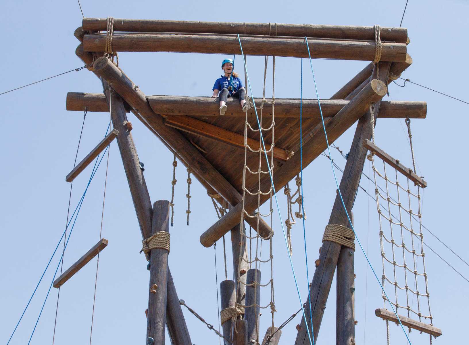
Photo: Israeli student on the Alpine Tower at the National Leadership Center