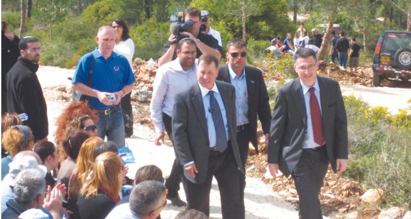
Photo: Ariel Mayor Ron Nachman at the National Leadership Center's Grand Opening in 2010.